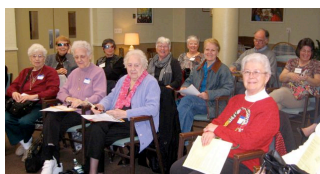
Worcester Secretaries Luncheon April 25, 2013 St. Anne's, Shrewsbury, MA