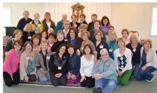
Look at the View Mini-Retreat April 23, 2013 La Salette Retreat Center, Attleboro, MA