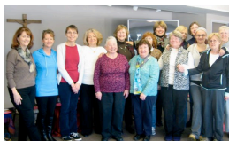
New Beginnings Women's Retreat April 5-7, 2013 Sacred Hearts Retreat Center, Wareham, MA